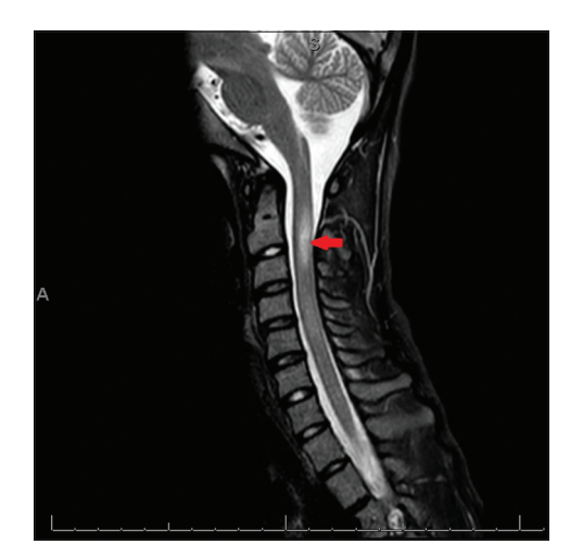
Figure 1: Cervical MRI shows a small lesion posterior to C2 and C3.

WBC - White blood cells; HGB - Haemoglobin; HCT - Hematocrit; MCV Mean corpuscular volume; MCH - mean corpuscular hemoglobin; PLT Platelets; PT - Prothrombin time; PTT - Partial thromboplastin time; INR - International normalized ratio; ALT - alanine aminotransferase; AST - aspartate aminotransferase; Na - Sodium; K - Potassium; BUN Blood urea nitrogen; ESR - erythrocyte sedimentation rate; CRP C-reactive protein