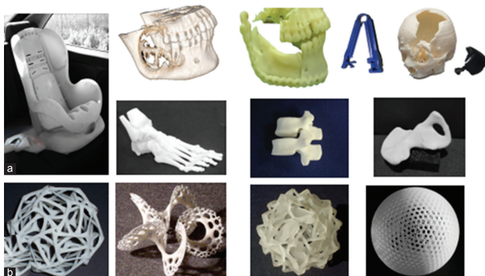
Figure 3: Representative images of applications of three-dimensional (3D) printing. (a) Customized chair in car, dental implants, umbilical cord cutter, skull part after craniotomy, foot spine, and pelvic bone models. (b) Geometric complexity is never a limitation of 3D printing